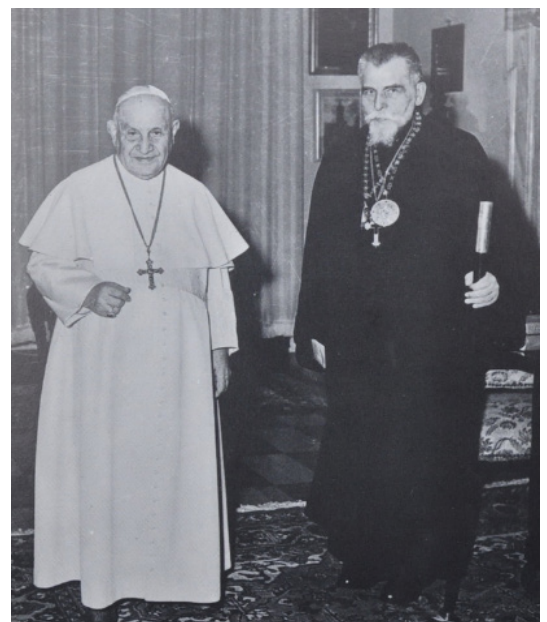
Josyf Slipyj meets Pope John XXIII upon release from Soviet imprisonment, 1963