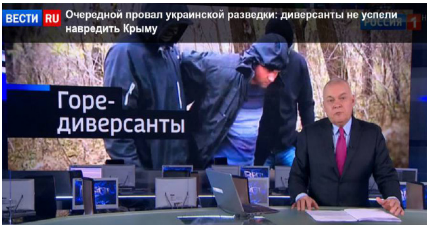
A TV report of the FSB catching "Ukrainian saboteurs" was broadcast on Russian state TV channel Rossiya 1. Caption: "Yet another failure of the Ukrainian intelligence: the saboteurs did not have time to harm Crimea; 'The saboteurs blew it'"

In order to keep conducting an aggressive foreign policy towards Ukraine to try force it back into the Russian geopolitical orbit, the Russian authorities need to enjoy the support of their population. Therefore, the bulk of Russian propaganda spread by government-controlled media works for the purpose of creating an alternative reality for its citizens which justifies the actions of the authorities.