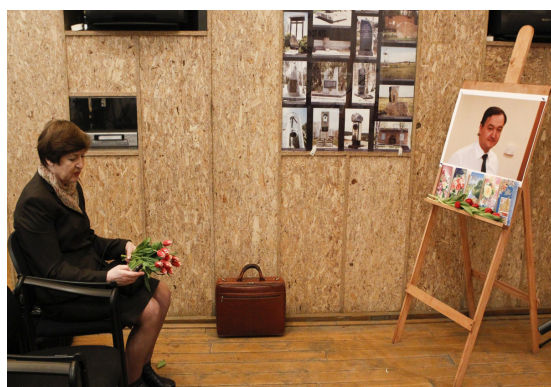
Mother of Sergei Magnitsky, a lawyer who died in Russian jail, at the event in memory of her son.