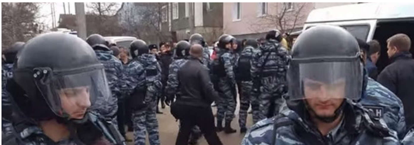
Armed searches of houses of Crimean Tatars are a regular occurrence in Crimea. Most of the detainments of the political prisoners take place during them.